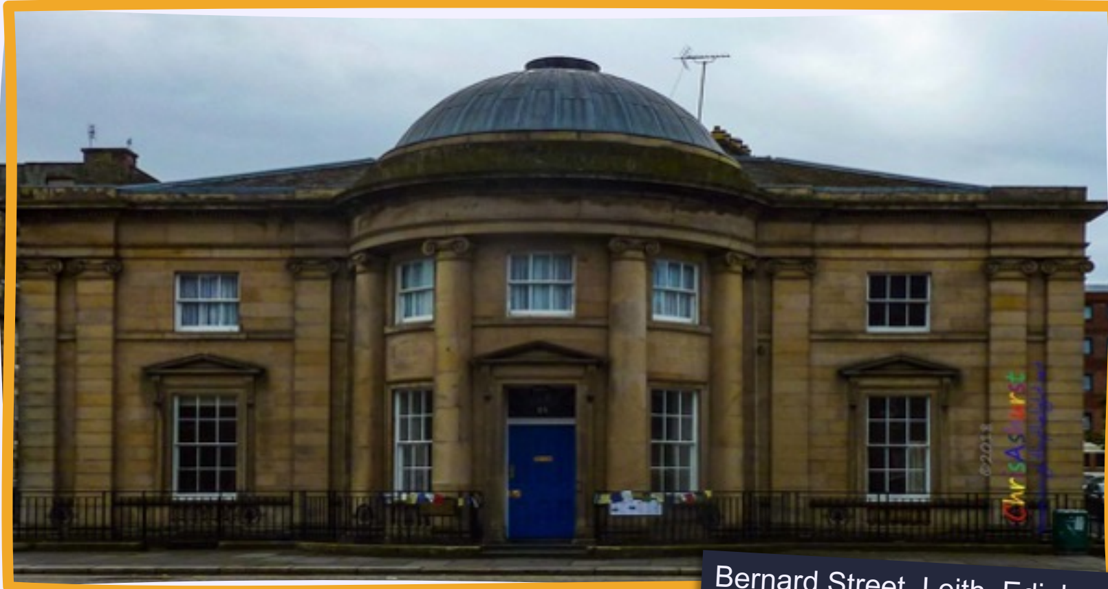
Bernard Street, Leith, Edinburgh