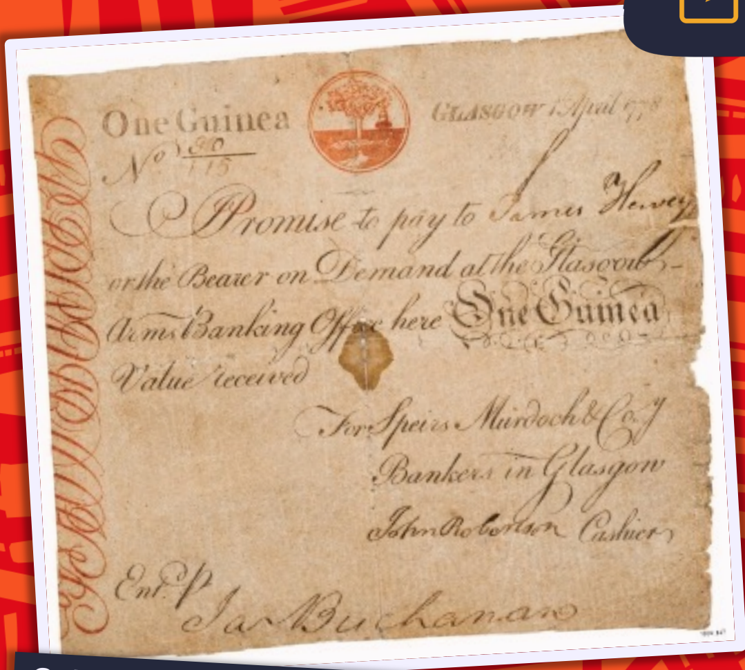
Guinea bank note issued by the Glasgow Arms Banking Company, 1778 (Glasgow Museums 1894.147)