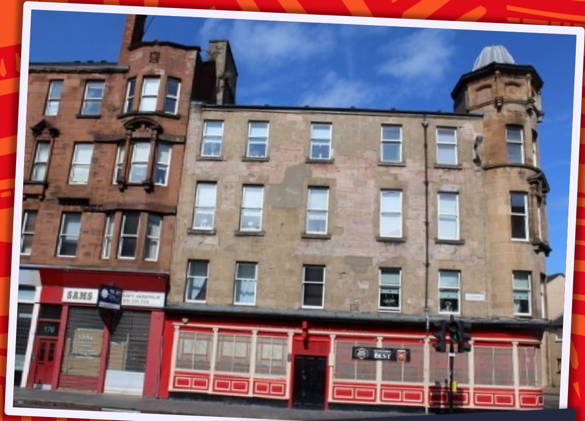
The site of The Ship Bank is now a pub in the Saltmarket area of Glasgow